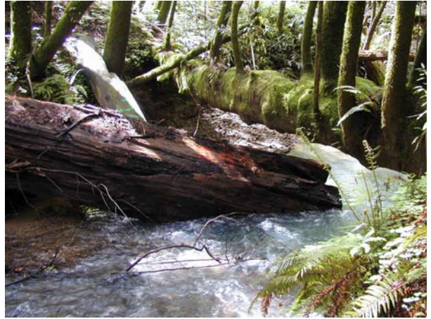
Large wood placed to improve fisheries habitat, Gualala River

The second workshop will be held in the Mill Creek watershed. It will provide an overview of the economic aspects of forest management. Topics to be covered include traditional and non-traditional forest products, biomass utilization, carbon credits, working forest conservation easements, and timber harvest procedures, documents, and regulations.